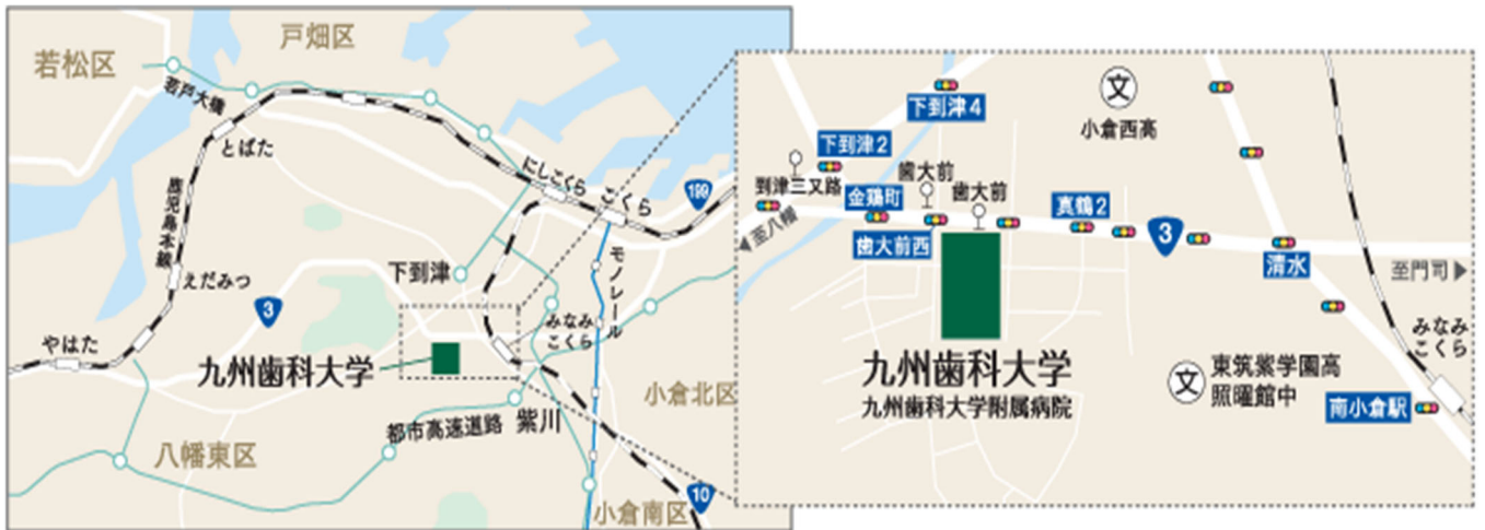
Kyushu Dental University Main Building